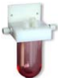
Armature de passage GD43