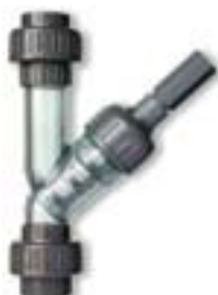
Armature de passage GD1V