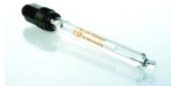
Electrode gel AH300K22PG